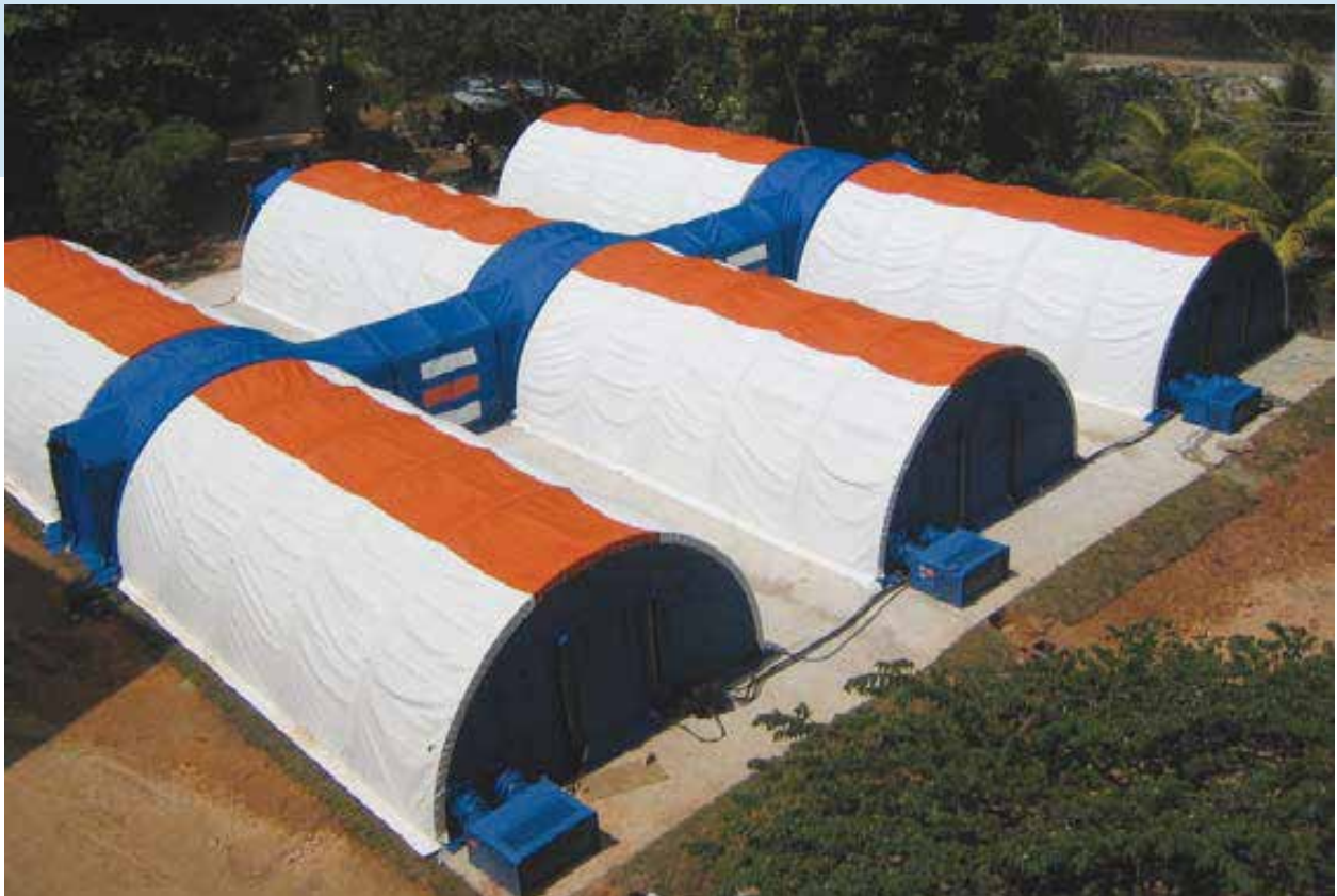
Galle, Sri Lanka Tsunami - A BLU-MED® facility replaced the University of Ruhuna Medical Center's maternity hospital lost in the tsunami. Because of its durability, the BLU-MED® hospital served the long-term expansion needs during recovery.