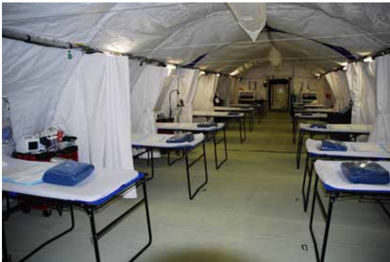
Patient ward equipped with adjustable BLU-MED® Beds